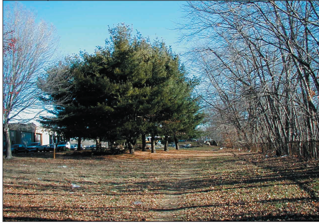
Figure 69: The greenway west of Alewife Brook is one of the three priority areas identified and will undergo detailed design in the next phase of planning.

The second project is the development of the Belmont Uplands adjacent to the Reservation