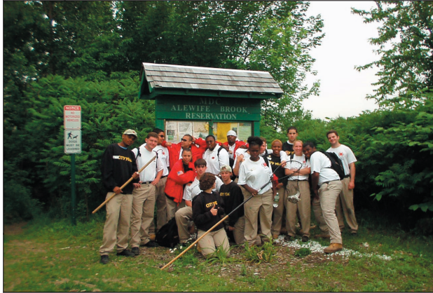
FIGURE 73. Teenagers displaying good stewardship of the Alewife Reservation by performing a trash clean-up.

Alewife Brook corridor. Educational materials could include brochures, newsletters, videos, models, and school curricula. After-school programs and guided tours will provide on-site education.